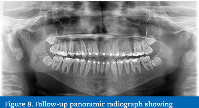
complete bone formation and no signs of recurrence after 16 months.