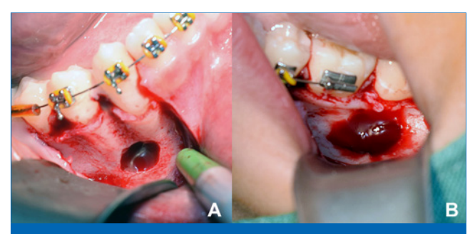
Figure 6. After a simple curettage, the complete filling with a blood clot is evident in both cavities. A) Right side; B) Left side.