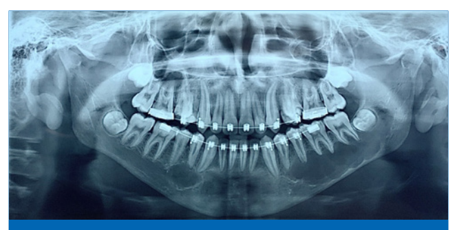
Figure 1. Panoramic radiograph showing well defined bilateral radiolucent images in the mandible.