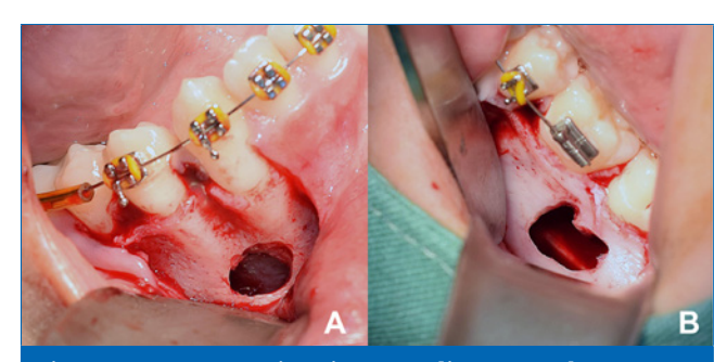
Figure 5. Transoperative view revealing empty bone cavities on both sides. A) Right side; B) Left side.

The radiographic follow-up was performed in the 4<sup>th</sup>, 8<sup>th</sup> and 16<sup>th</sup> months, showing complete bone neoformation (Figures 7, 8).