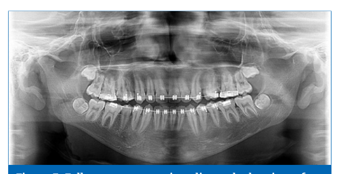
Figure 7. Follow-up panoramic radiograph showing, after 4 months, the new bone formation in progress, and no signs of the recurrence of the lesions.