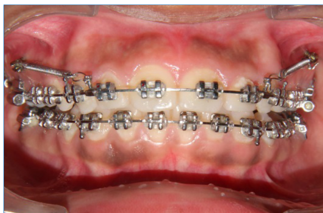
Figure 1. Distalizing force applied with NiTi closed coil springs placed bilaterally from the attachments placed between the maxillary incisor and canine to mini-implants inserted between the maxillary second premolar and the first permanent molar.

OIIRR was assessed with CBCT taken prior to the start of distal movement (T1) and six months after distal movement (T2). All CBCTs were obtained with the same machine, the Sirona XG 2.63 machine (2016 Sirona Dental Systems, GmbH),