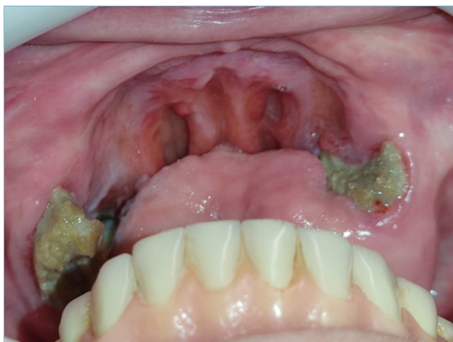
Figure 4. Post-rehabilitation assessment: 30 days after denture installation.