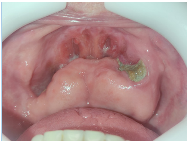
Figure 5. Post-rehabilitation assessment: 9 months after denture installation.