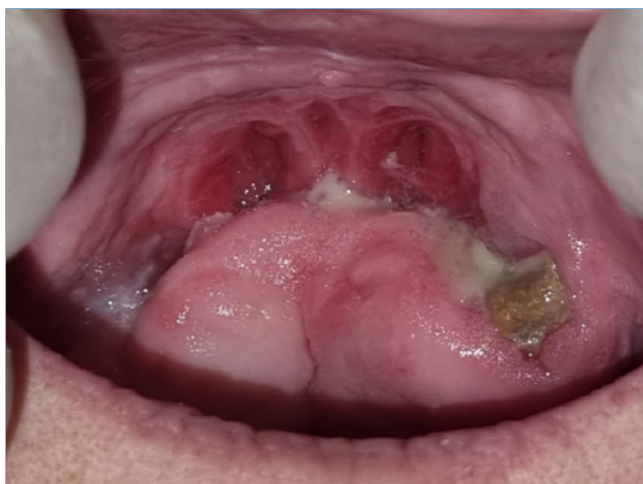
Figure 6. Post-rehabilitation assessment: 16 months after denture installation.