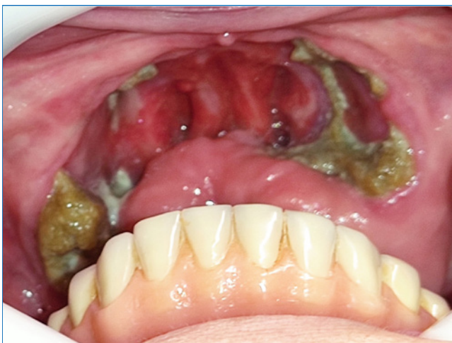
Figure 1. Clinical condition of the oral cavity at the initial appointment.