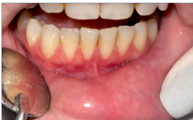
Figure 5. Complete regression of the larger mucous patch in the central region of the lower labial mucosa 14 days after starting treatment with Penicillin G Benzathine.

and non-reactive results for other rapid screening tests (HIV, hepatitis C, and hepatitis B). After confirming the diagnosis, the patient was referred to the medical service for treatment with Penicillin G Benzathine 2.4 million IU, administered via intramuscular injection once a week for three weeks. The diagnostic VDRL test showed a titer of 1:128.