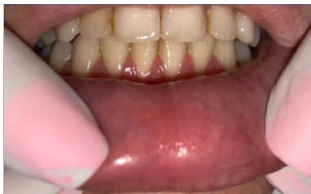
Figure 7. Complete regression of the larger mucous patch in the central region of the lower labial mucosa 30 days after starting treatment with Penicillin G Benzathine.