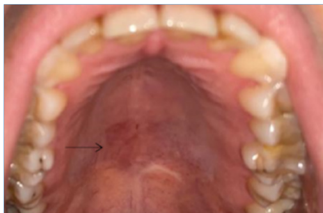
Figure 6. Complete regression of the larger lesion in the central region of the hard palate 30 days after starting treatment with Penicillin G Benzathine.