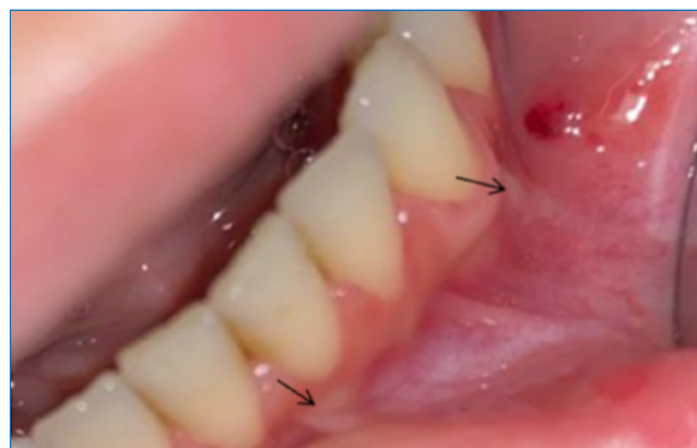
Figure 2. Smaller mucous patches with irregularly shaped white fibrinous pseudomembranes in the lower vestibular sulcus near teeth 41 and 42 and teeth 33 and 34.