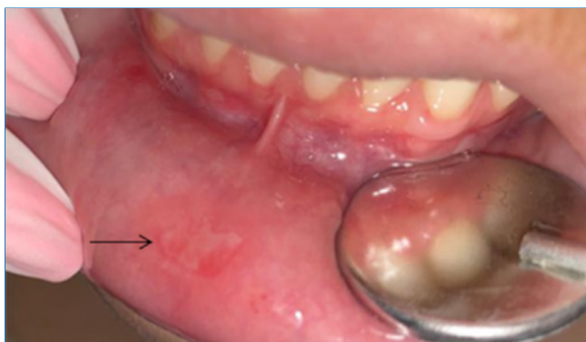
Figure 3. Larger mucous patch with an irregular appearance and coalescence, slightly elevated with white fibrinous pseudomembrane and surrounded by erythema in the central region of the lower labial mucosa.