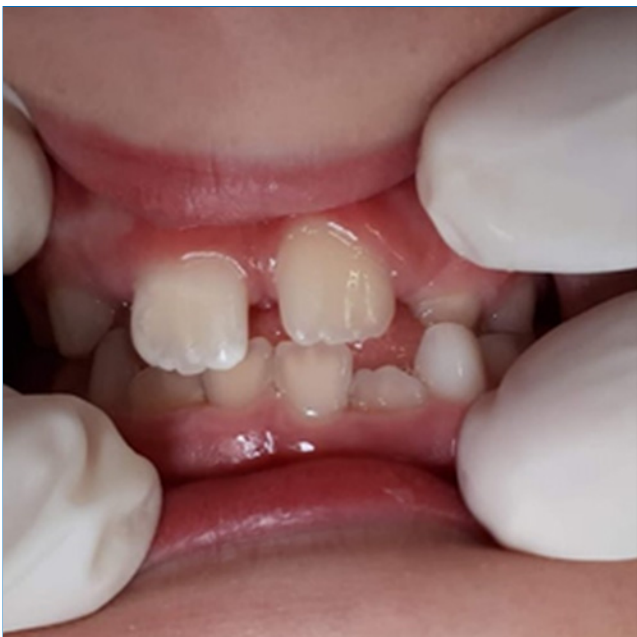
Figure 5. Clinical preservation after nine months. The color of the tooth remained stable.

At 18 months of follow-up, the tooth presented an advanced stage of external root resorption (Figure 8). After 21 months since the trauma, a ulotomy was performed for tooth 22 eruption. The periapical radiograph exhibited cervical external root resorption (Figure 9).