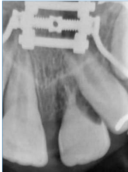
Figure 8. Periapical radiograph eighteen months after the trauma. Left maxillary central incisor (21) showing advanced stage of external root resorption.