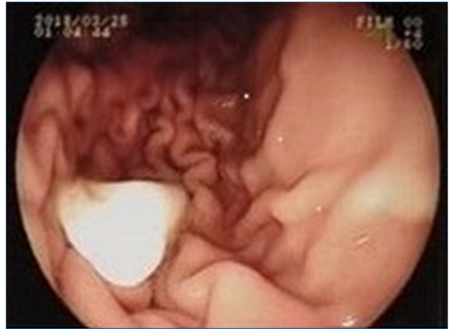
Figure 1. Upper gastrointestinal endoscopy image (esophagogastroduodenoscopy) showing the tooth lodged in the stomach mucosa.