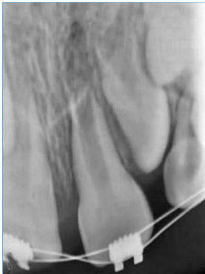
Figure 3. Periapical radiograph one week after the trauma, with the left maxillary central incisor (21) showing a regular root surface aspect.