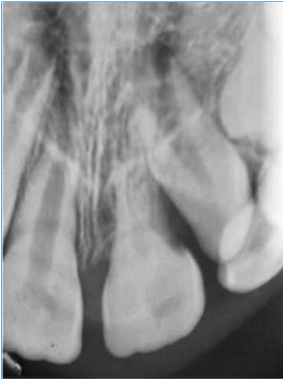
Figure 7. Periapical radiograph twelve months after the trauma. Left maxillary central incisor (21) showing external root resorption in the cervical third.