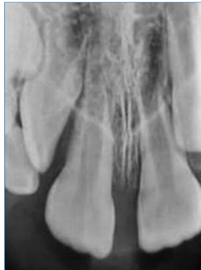
Figure 4. Periapical radiograph three months after the trauma showing no signs of ankylosis or root resorption.

remained stable (Figure 5). A cone beam computed tomography (CBCT) suggested a formation of calcified tissue in the root's apical third (Figure 6). At the 1-year follow-up, a periapical radiograph showed external root resorption in the cervical third of 21 (Figure 7). The patient did not exhibit fistula, gingivitis, pain, or any change in tooth color. The tooth was in infra-occlusion, and the clinical crown was 7 mm long.