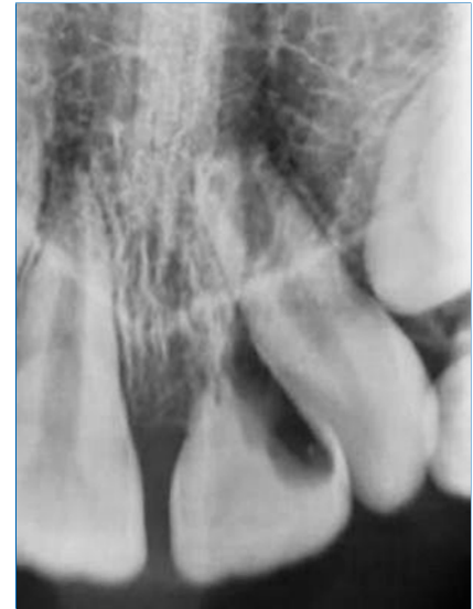
Figure 9. Periapical radiograph twenty-one months after the trauma. Left maxillary central incisor (21) showing advanced stage of external root resorption.

Twenty-four months after the trauma, there was a pink spot in the cervical third of the crown, indicating the advanced stage of root resorption. Orthodontic brackets were bonded for traction on tooth 22, which was on a collision course with the crown of tooth 21. No bracket was bonded to 21. At 27 months after the trauma, the enamel in the cervical region of 21 was fragile, and the color change was more evident.