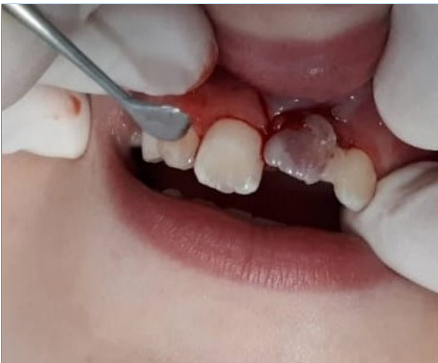
Figure 10. Clinical image thirty months after replantation. Left maxillary central incisor (21) showing a large part of the tooth resorbed.

Replanted tooth management relies on two critical criteria: the stage of root development and the status of the periodontal ligament cells. 6,20 The former is crucial because an immature tooth has the potential for pulp revascularization following avulsion and replantation. This process enables the ongoing development of the root, eliminating the need for endodontic treatment. 6 The time the tooth spends outside its socket and the medium used to store it influence the viability of periodontal ligament cells, which is crucial for tooth replantation success. 6,20 Ideally, the tooth should be repositioned into its socket immediately or within 15 minutes after the accident, maximizing the chances of viable ligament cells