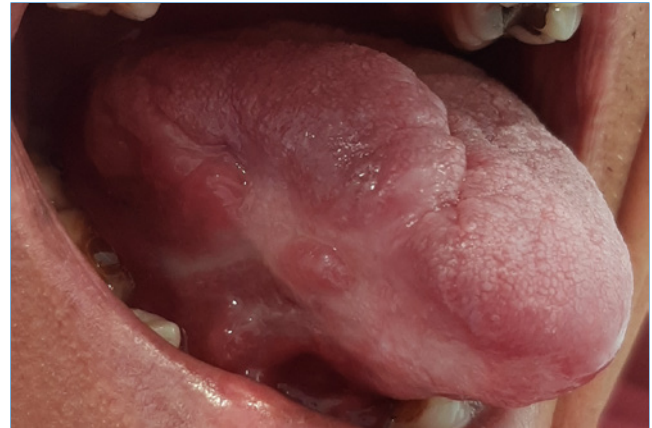
Figure 4. Remission of the ulcers on the right lateral region of the tongue.