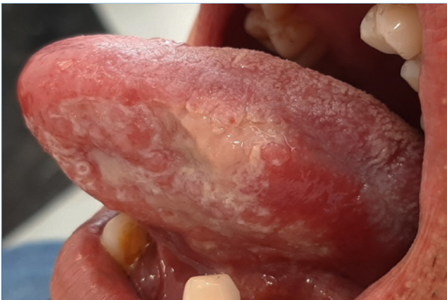
Figure 2. Ulcer on the left border of the tongue extending to its ventral region.