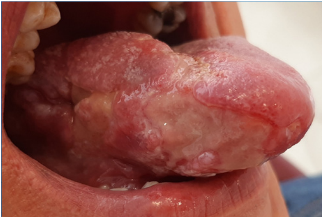
Figure 1. Irregular ulcers on the right border of the tongue extending to its dorsum and ventral region.