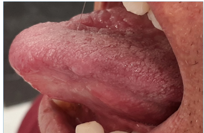
Figure 5. Remission of the ulcer on the left lateral region of the tongue.