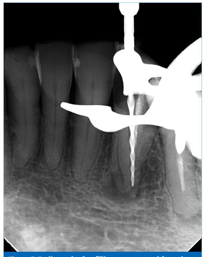
Figure 7. Radiograph after filling was removed from the buccal canal, showing evidence of the lingual root.