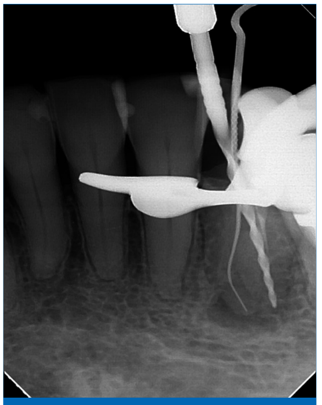
Figure 8. Lingual canal negotiated with a #15 hand file and buccal canal instrumented with a Reciproc Blue #40.