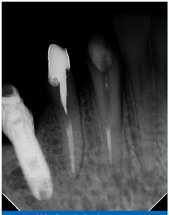
Figure 1. Initial radiograph of tooth 43.

The patient, a 77-year-old Caucasian woman, was referred for endodontic retreatment of tooth 33 due to asymptomatic apical periodontitis (Figure 6). The access cavity was performed with a round high-speed diamond bur (1014, KG Sorensen, Cotia, Brazil) under suitable anesthesia and rubber dam isolation. After locating the root canal, the filling material was removed using a Reciproc Classic #25 instrument (VDW Dental, Munich, Germany), without solvent, and a radiograph was taken to confirm the working length (Figure 7). The radiograph taken from a mesioradial angle suggested the presence of an additional root on the lingual surface. An operating microscope (16x magnification) and a pear-shaped diamond ultrasonic tip (E6D, Helse, São Paulo, Brazil) were used to remove dentin in the lingual direction, revealing the presence of an isthmus and evidencing the lingual root canal. The root canal was located and negotiated with C-Pilot # 10 and # 15 files (VDW Dental, Munich, Germany) (Figure 8) and instrumented with a Reciproc