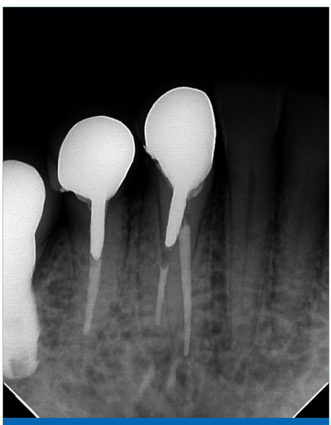
Figure 5. 18-month follow-up radiograph showing periapical tissue normality.