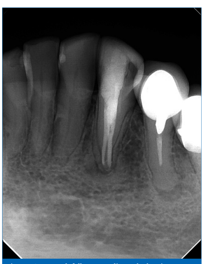
Figure 10. 5-month follow-up radiograph showing healing of periapical tissues