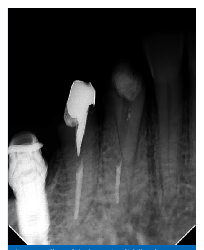
Figure 2. Radiograph in the mesioradial direction showing the presence of the lingual root.