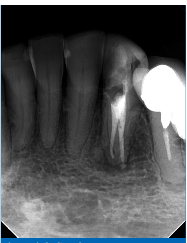
Figure 9. Final radiograph