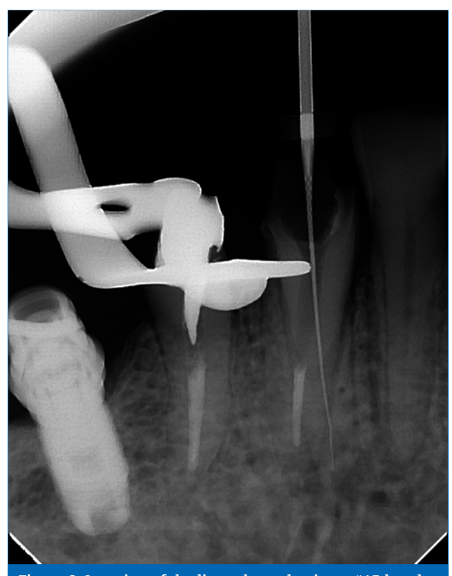
Figure 3. Location of the lingual canal using a #15 hand file at the working length.