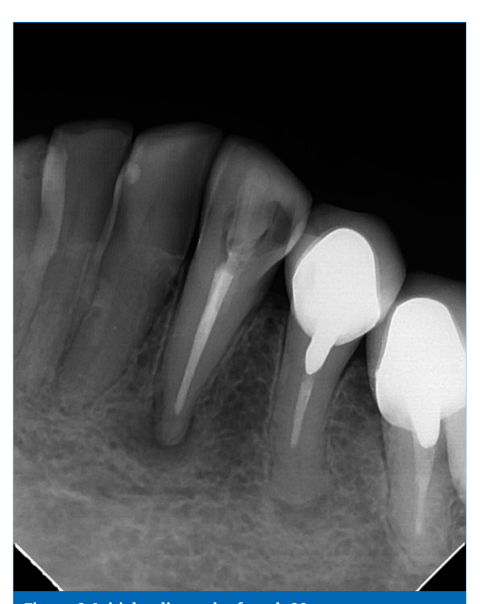
Figure 6. Initial radiograph of tooth 33.