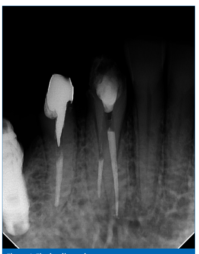
Figure 4. Final radiograph.